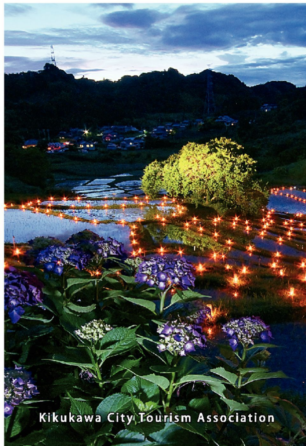
Kikugawa City Tourism Association